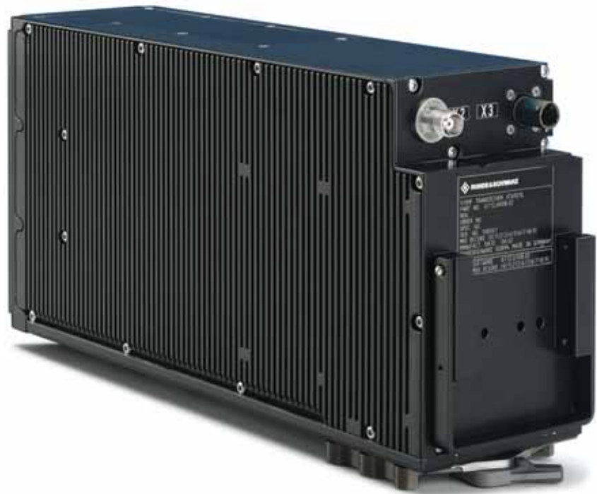
VHF/UHF Transceiver R&S MR 6000A

The R&S MR 6000A is the somewhat larger member of the R&S M3AR family and accommodated in a standard housing to ARINC 600. This high-end unit from the R&S M3AR family provides a large number of additional features such as embedded NATO-COMSEC and black key loading, as well as a higher output power of 20 W (AM) and 30 W (FM).