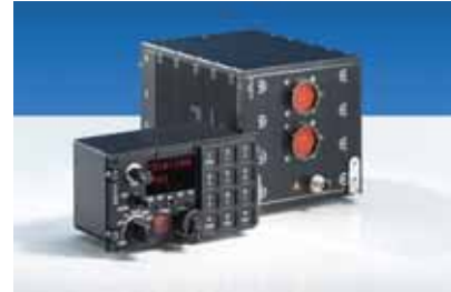
R&S MR6000R remote-control version with Remote Control Unit R&S GB6500