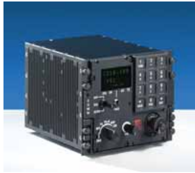
R&S MR6000L cockpit version

The R&S MR6000L and R&S MR6000R transceivers are also available with MIL-BUS interface for integration into airborne platforms that provide MIL-BUS control systems.