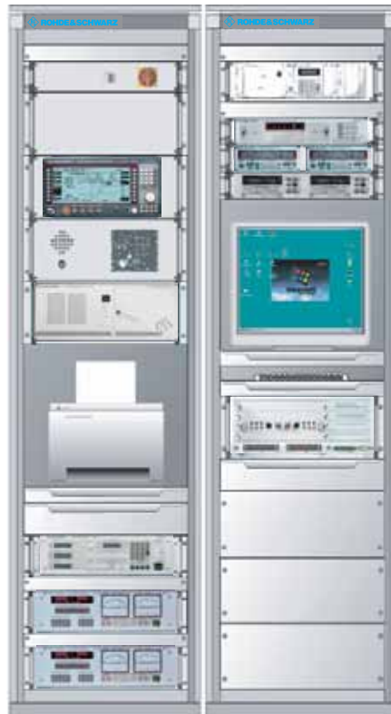
Maintenance Test Station R&S TS6001

For error diagnosis at the various maintenance levels, a manually controlled flight-line tester or an automatic maintenance test station can be used.