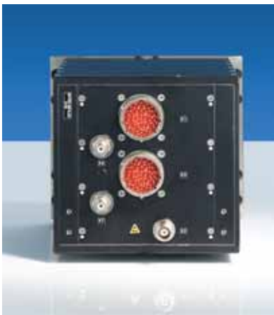
R&S MR6000L rear view of MIL-BUS version

The R&S MR6000L and R&S MR6000R units are suitable for outfitting many new airborne platforms. They are also ideal for F 3 retrofitting (form, fit, function) to replace AN/ARC164 radios with or without adapters.